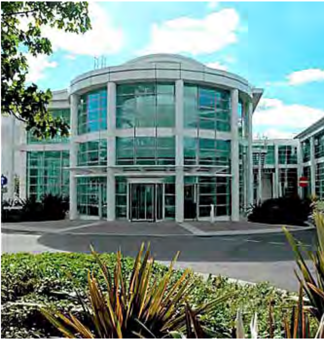
National Physical Laboratory

this to an extremely high precision. So will they be adjusted? The atomic clock housed in Britain's National Physical Laboratory (NPL) is the world's most accurate, according to new research.