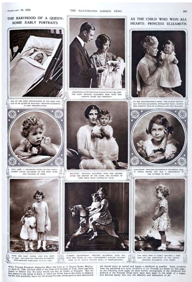
Collage from The Illustrated London News , February 1952

The State funeral given to her late Majesty was symbolic of the tradition of the constitutional monarchy but also of the affection and love we felt for her. It was truly magnificent, and we must thank those who planned it and those who executed it. The plans had been in hand for many years, no doubt updated regularly. The Queen herself was involved in the planning. She was involved in the design of the state hearse, and it was the Queen who suggested having lights to illuminate the coffin if the hearse was to move in the dark.