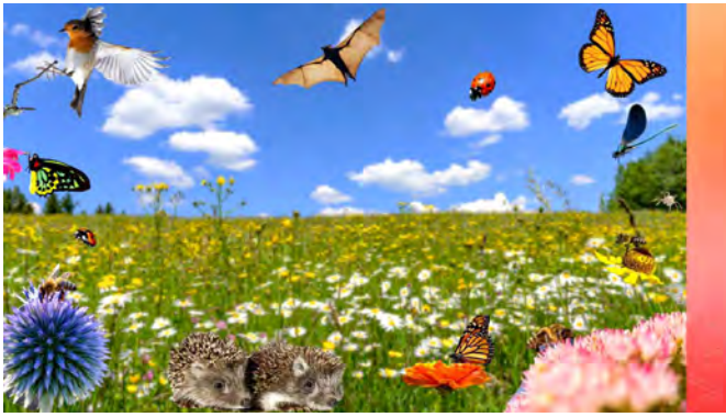
Nature board illustration by Caroline Oliver