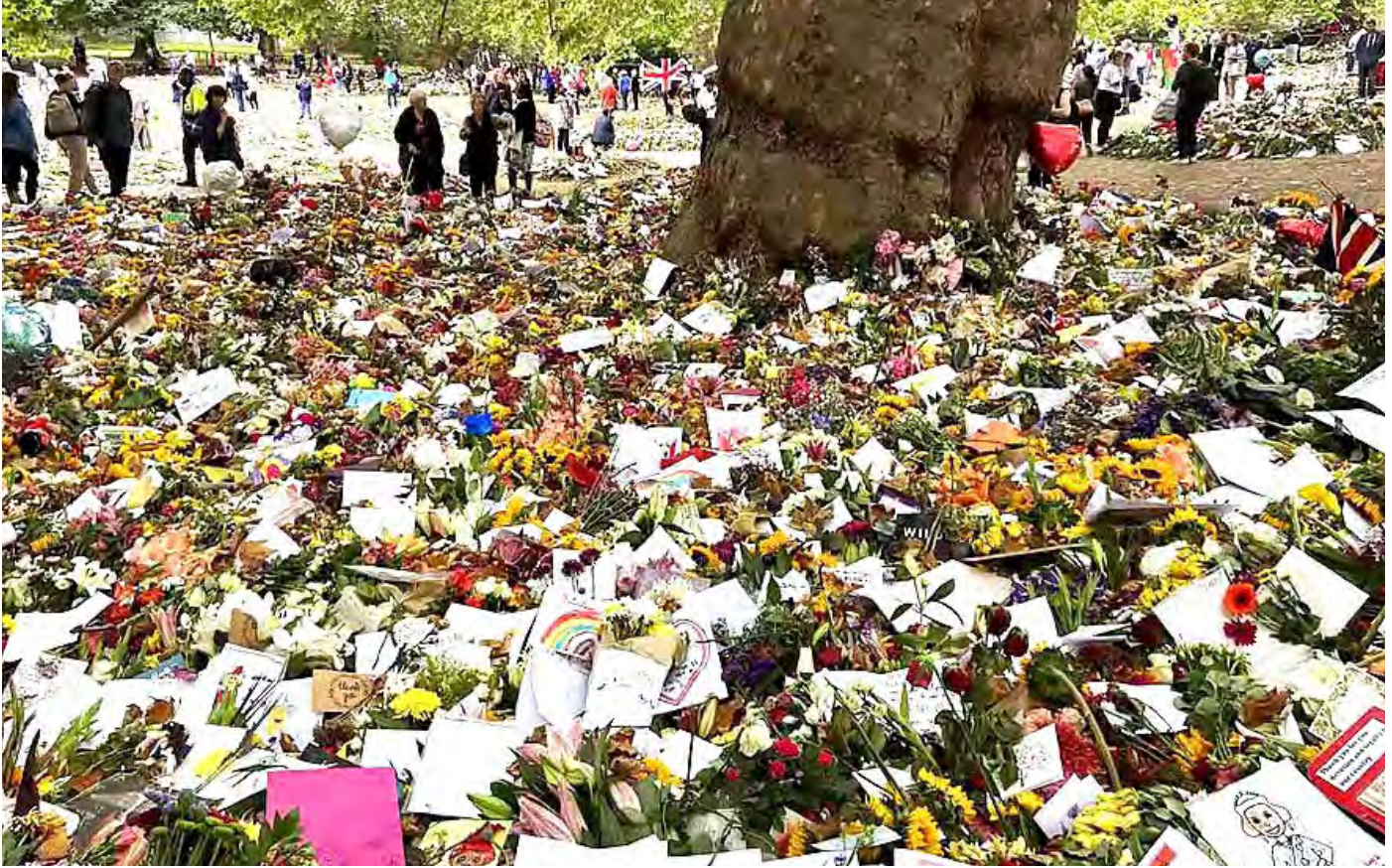
Beautiful floral tributes to the late Queen Elizabeth in Green Park