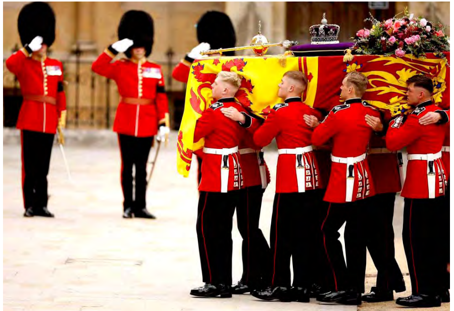
Queen's Company, Grenadier Guards carrying out their proud duty

The Queen had a profound faith, which helped her to deal with her personal tragedies, which she still endured as she had vowed she would. She revelled in the joy of the nation at her Platinum Jubilee. She had served all her people well and we were grateful and loved her for the service she gave to us. As Paddington Bear said, 'Thank you, Ma'am... for everything.'