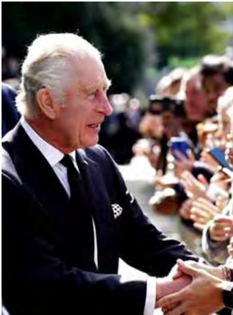
His Majesty King Charles III