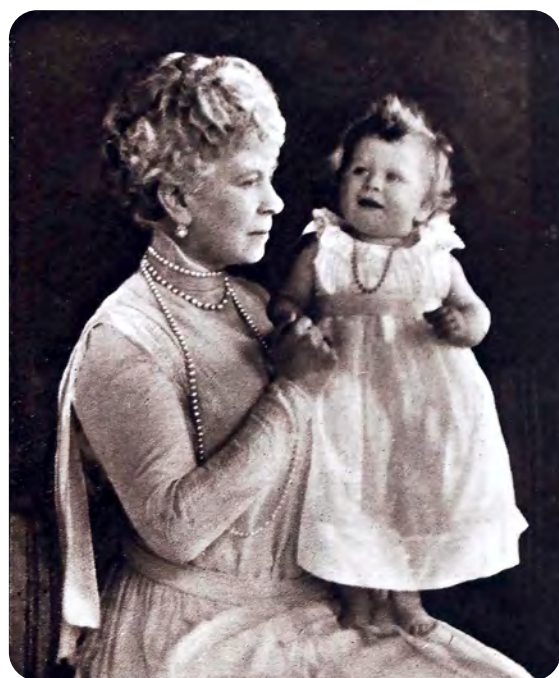
Queen Mary with her 11 month old granddaughter, Princess Elizabeth

I have the photographs of the Queen at Paddington Station with her mother, Queen Elizabeth the Queen Mother, and Queen Mary to see the King's coffin on his last journey.