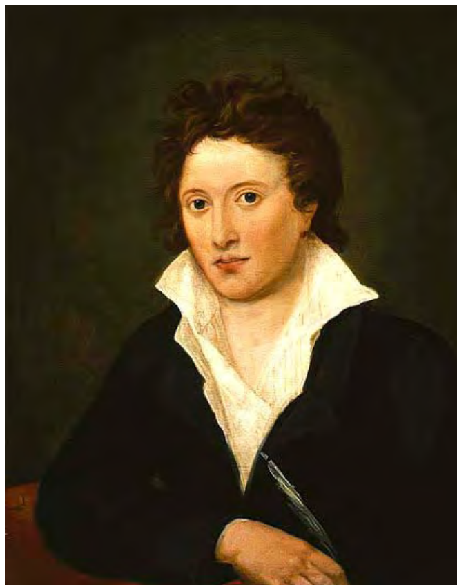
Percy Bysshe Shelley

Those sentiments were a direct challenge to both the individualistic Romantic ethos of Percy Shelley, and the Enlightenment political theories that had been articulated by her father. Already, when she was 15, he had described her as “singularly bold, somewhat imperious, and active of mind. Her desire of knowledge is great, and her perseverance in everything she undertakes almost invincible.”